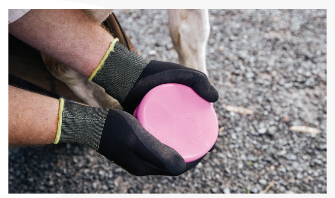
Check Tubbease is fitting hoof correctly and then pull sock up carefully.