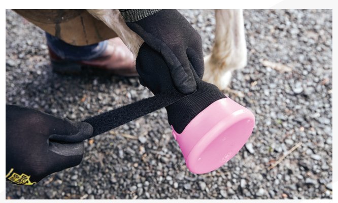
With sock taut, fit hook and loop strap to lower pastern with hook side facing sock. Ensure one finger space under strap.