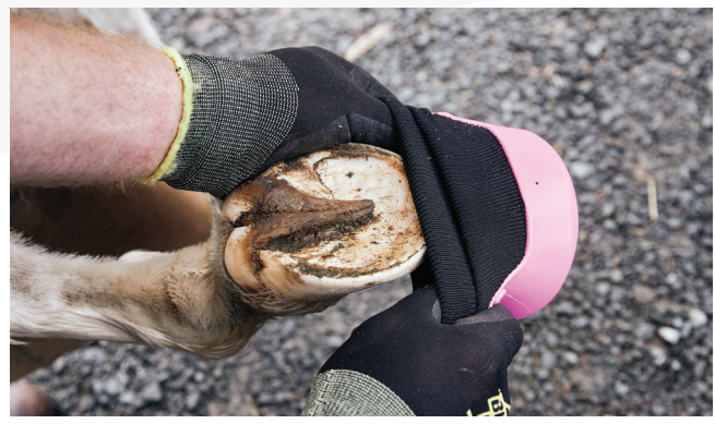
After preparing or medicating the hoof, open sock wide and pull Tubbease over hoof using tabs at side.

Please note: Measurements indicate maximum internal width of Tubbease.