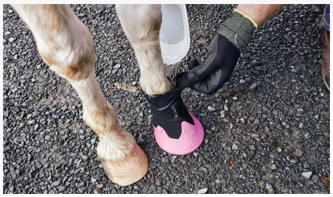
With hoof on the ground, simply pour in treatment solution as required, or submerge fitted hoof into a bucket of your chosen solution for deeper soaking.